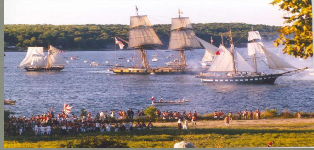
Battle of Georgian Bay 2001 – Midland, ON